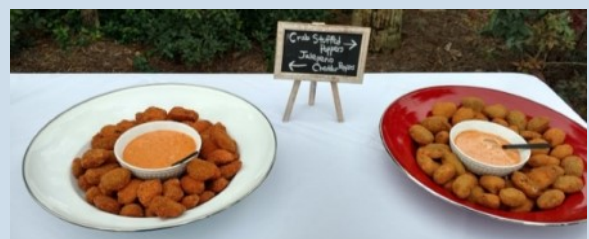
Thanks to Doc Myers' Sports Bar & Pub for the tasty snacks