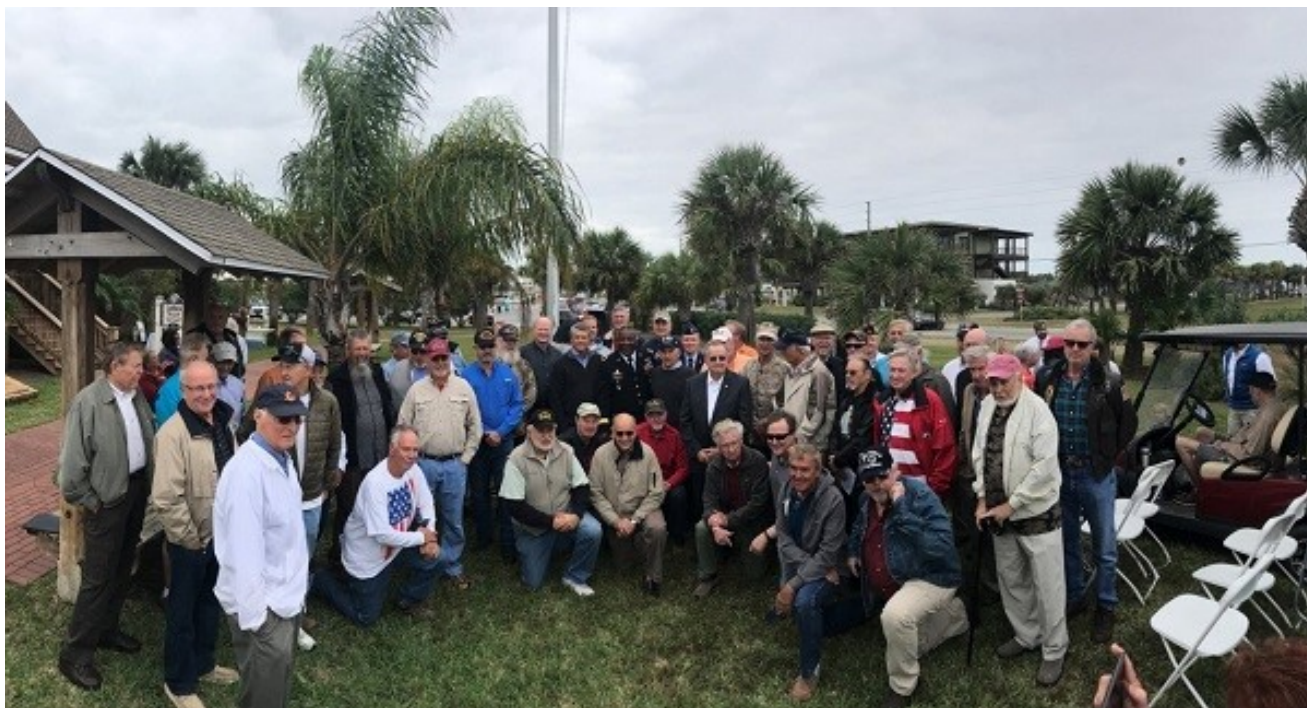
Over 65 veterans were in attendance at the first annual Veterans Day Ceremony hosted by St. George Lighthouse Association. We are proud to honor our veterans all over the world and thank you for your service.