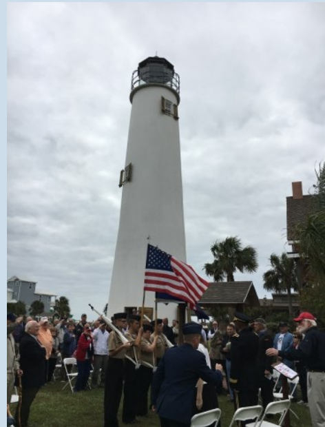
Port St. Joe Navy Jr. ROTC, posting of the colors